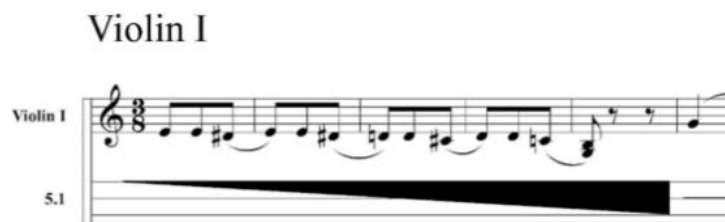
Figure 1 : a notation of spatialization for a 5.1 system

Moreover, some tries to achieve notation of spatialization of the score becomes dependent on the physical implementation, like the following one that is dependent on a 5.1 system [Ellberger 06]: